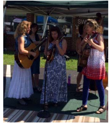
Bluegrass group Sweet Yonder performing at the Farmers Market.

Summer may be over but the Farmers Market is just getting started. TJ Michael, balloon artist, will return to the market September 6! On September 13, the Patrick Henry Library will be our guest nonprofit and at 10 am will feature a storyteller in front of the playground. Also on September 13, Faith Baptist kicks off its annual Giveback Day, more details to follow. On September 20, we welcome back unofficial market guests--Vienna Moms!